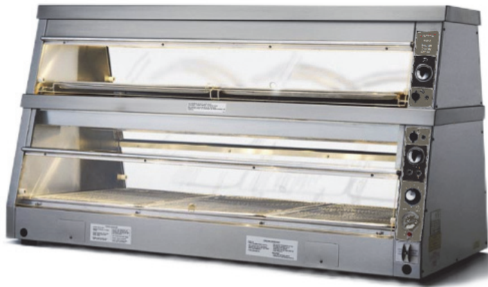
HCW 5 display counter warmer with flip-up doors for pass-through service

Henny Penny display counter warmers are designed for accumulating, holding and displaying hot fresh food for serving or packing at the point of sale in retail foodservice operations.